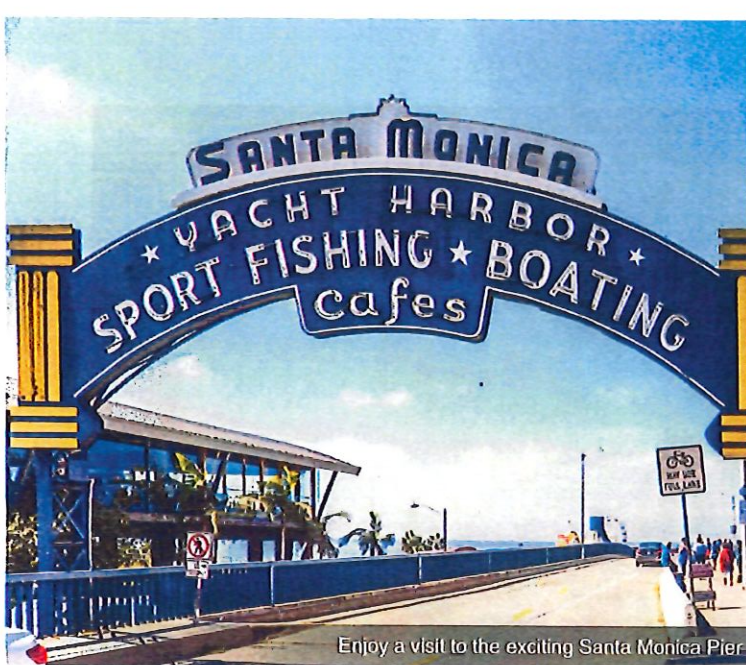
Enjoy a visit to the exciting Santa Monica Pier

the Tournament of Roses Parade. View the animated floats, the precision of the marching bands and the equestrian teams as you become part of an event that is seen throughout the world by millions. Later, travel north up the coast to the pretty town of Santa Monica. Here, there is time to explore the exciting Santa Monica Pier. Delight in the wide array of shops, arcades and lively entertainment. Tonight, your farewell dinner is in Santa Monica hosted by your Tour Manager. Meals: B, D